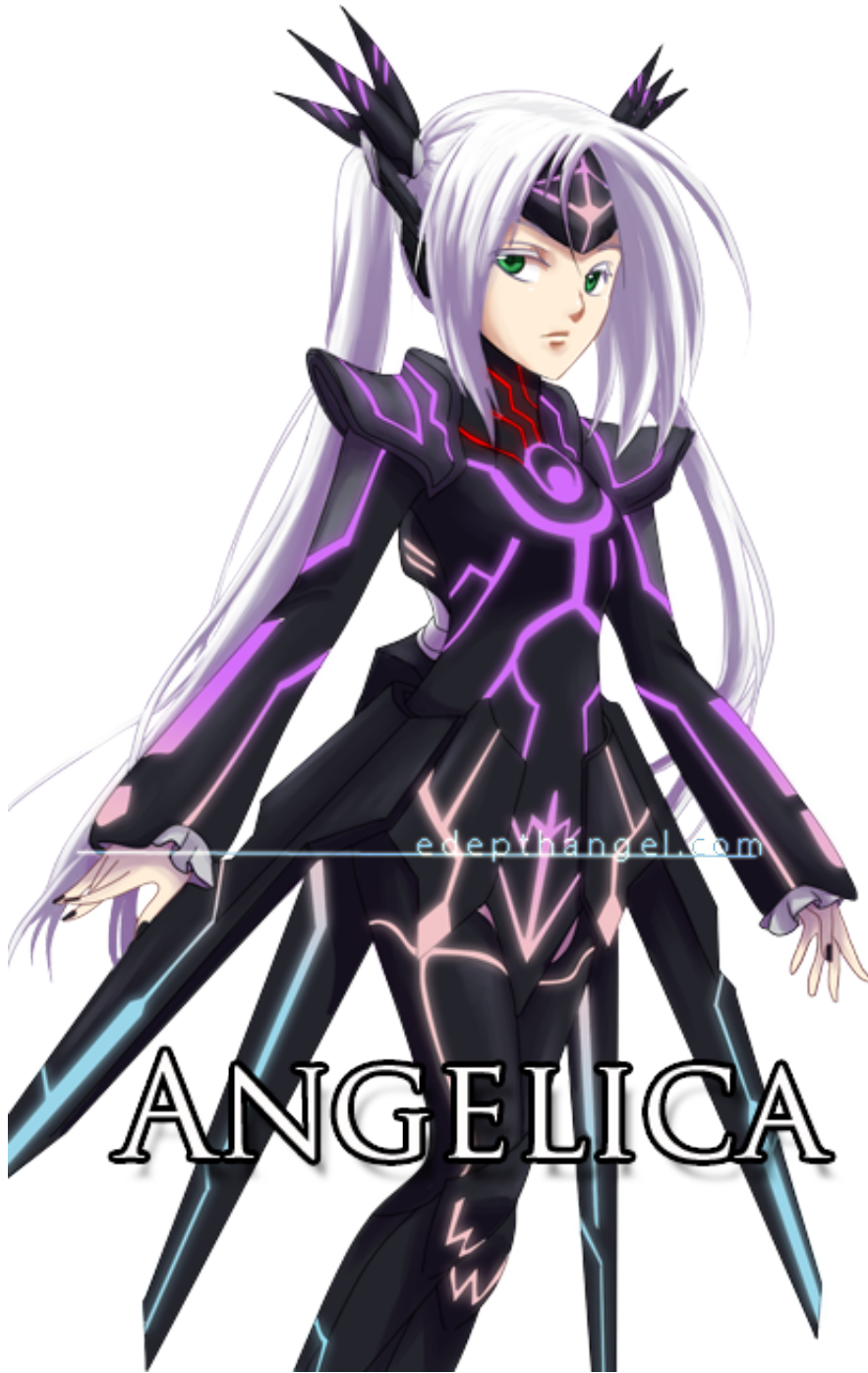
Angelica - llcyborg??ll a cyborg with appearance that closely resembles Angel. She relays messages for Angel and helps Angel with her work.